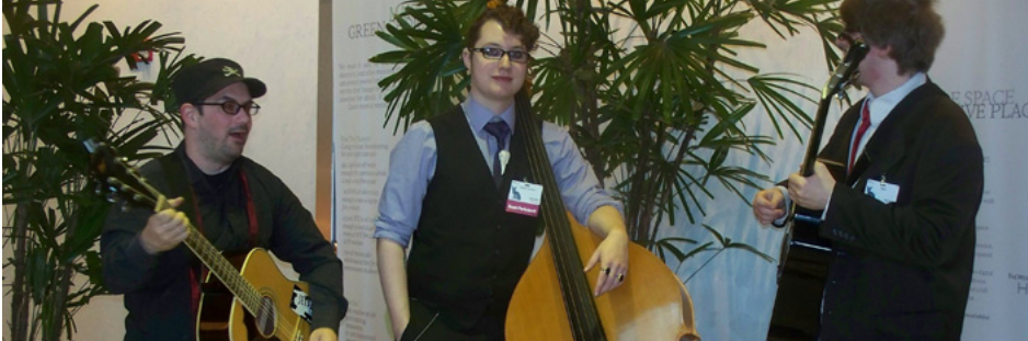
Members of The Piscis Volans Circus steam-punk circus troupe